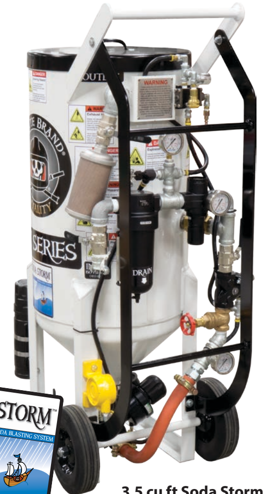
3.5 cu ft Soda Storm