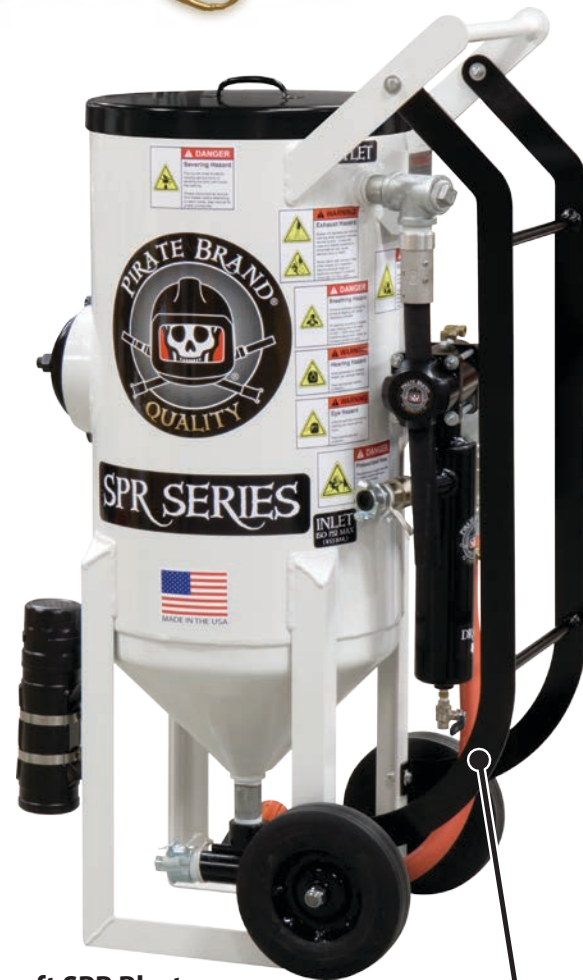
3.5 cu ft SPR Blaster